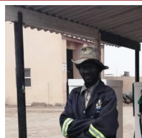
Late Paulus Nuuyoma